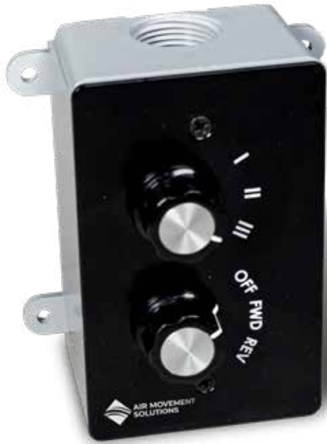
Control panel (included)